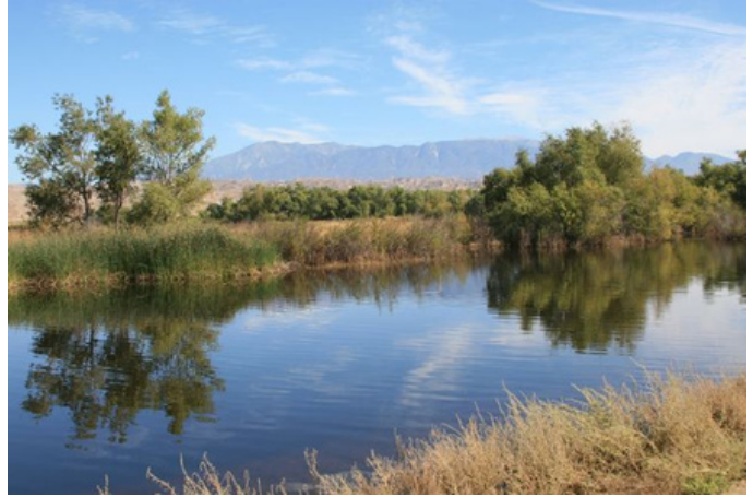
San Jacinto Wildlife Area, Oct. 19, 2008

Moreno Valley Business Center (MVBC): This poorly located warehouse will be at the NE corner of Alessandro Boulevard and Day Street. The census tract containing this project site shows its residents are in about the worst 1% of areas in all of California for air pollution and other socioeconomic impacts. On Thursday January 5, 2023 our Sierra Club attorney filed a lawsuit. Because of the lawsuit your Moreno Valley Sierra Club volunteers were able to work out a settlement with the developer and their attorney to provide some protections to nearby residents from air pollution and noise as well as provide further protection for the environment.